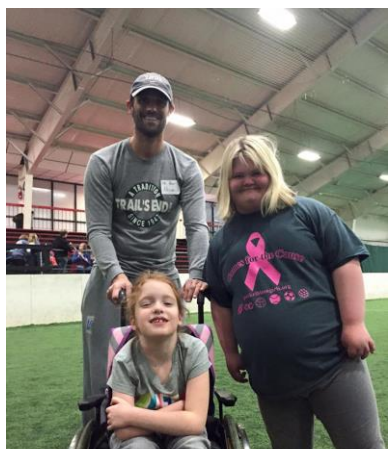
Soccer Training Day

A few of the 24+ SOHC programs your donation will continue to foster.